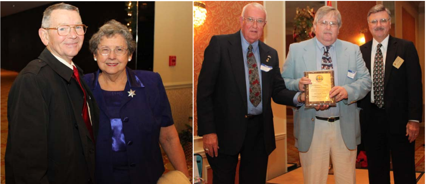
Above: Additional pictures taken at the Annual Christmas Party held on December 16, 2011 at the Chattanooga Choo-Choo Imperial Ball Room