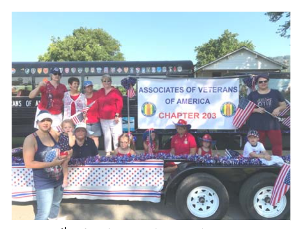
4th of July Parade Dunlap, TN.

To create a better everyday life for Veterans and their families.