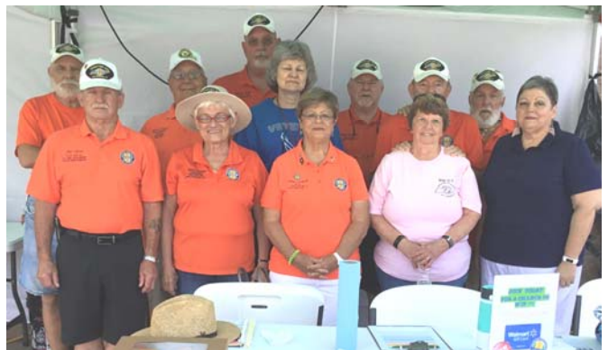
AVVA Members participating in the Walmart Membership Drive & Collection in Kimball, TN.